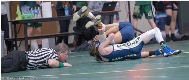
Sapshots - Photostipply